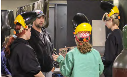
Welding students speak with a family member visiting the CTE center during EXPO Night.

On Nov. 16, the WEMOCO Career and Technical Education Center was abuzz with families, potential students, district counterparts and industry partners for CTE EXPO Night. Thousands of grades 8-10 students and their families were invited to explore the breadth of CTE offerings. Guests were able to experience the in-demand skill training that occurs through applied learning, speak with CTE staff in the applied learning environments, tour the industry-aligned lab spaces, and hear from current students and alumni.