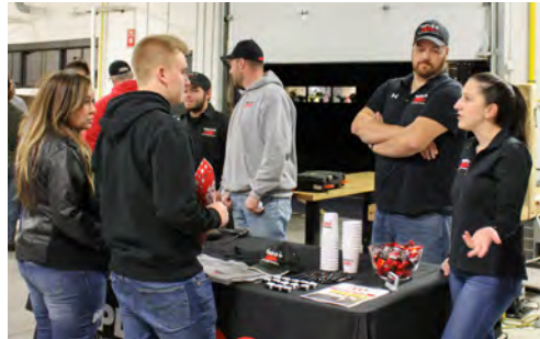
Industry partners from Triple O Heating, Cooling, Electrical and Plumbing were on hand in the HVAC classroom to answer questions about the field.